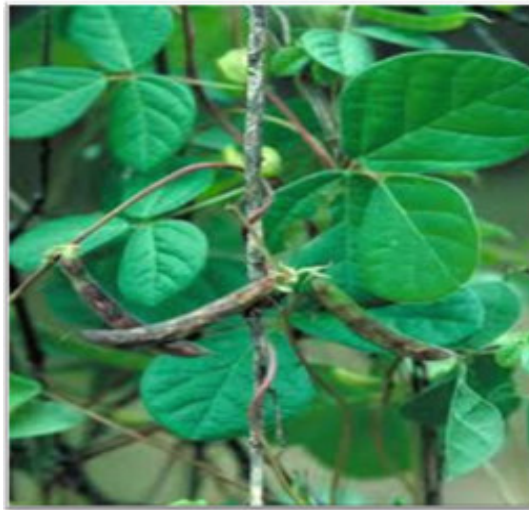
Figure 1 Impact of P. polymyxa on M. uniflorum (Different aspects)