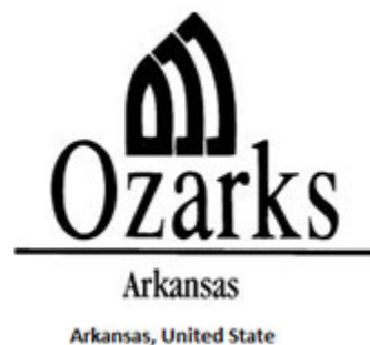
Arkansas, United State

Friedrich-Alexander-Universität Erlangen-Nürnberg