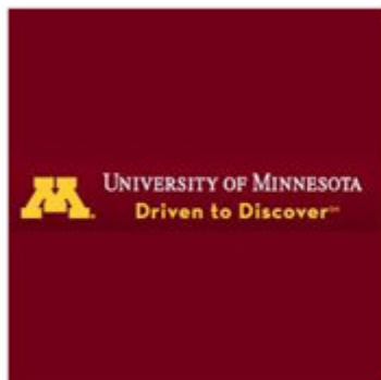
Minneapolis , United States of America