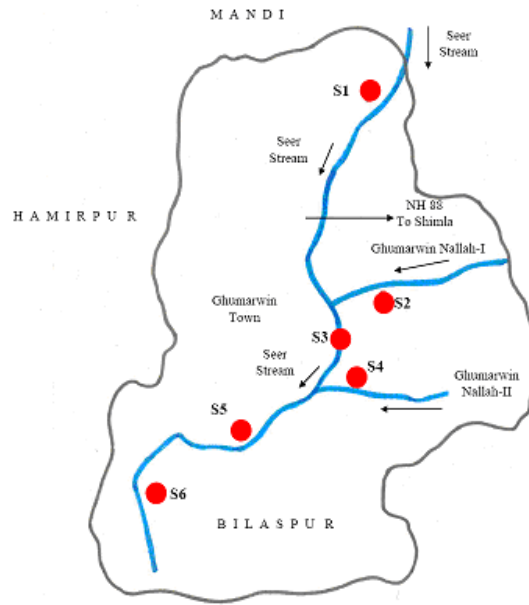
Figure 1 Location Plan of Sampling Station on Seer Stream